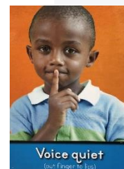
Voice quiet (tip finger to lips)