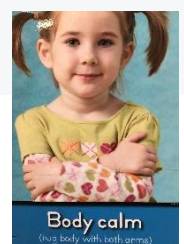
Body calm (hug body with both arms)