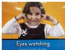
Eyes watching (go or to corners of eyes)