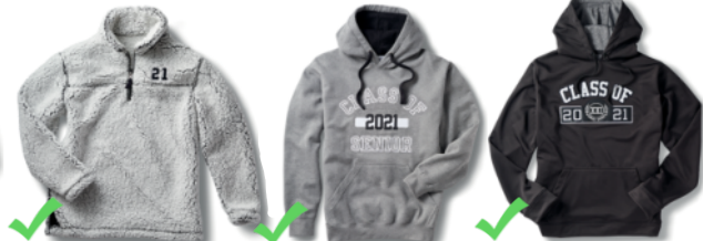
Your choice of hoodie in Braves package