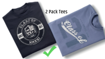
2 Pack Tees

Choose the Braves Package and get your 2-Pack Shirts, choice of hoodie and Key Ring with Free Shipping at the Curbside Delivery. 3 Payments of $107